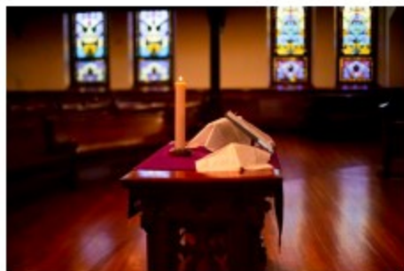
Communion Table, Maundy Thursday Service