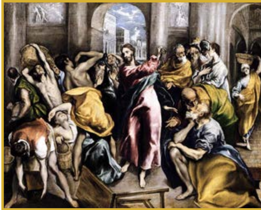
Purification of the Temple El Greco, 1610