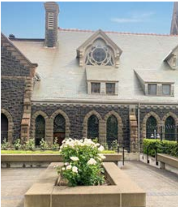
Plaza garden plantings

Through the past two years, a small group of volunteers has worked tirelessly to remove overgrown plants from our plaza garden. They removed ivy from the south church wall