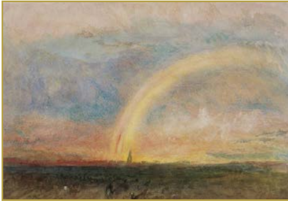
“The Rainbow” J.M.W. Turner, 1835