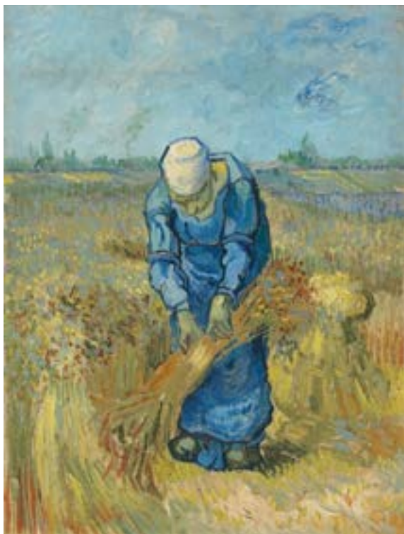
Vincent Van Gogh, "Peasant Woman Binding Sheaves," after Millet, 1889