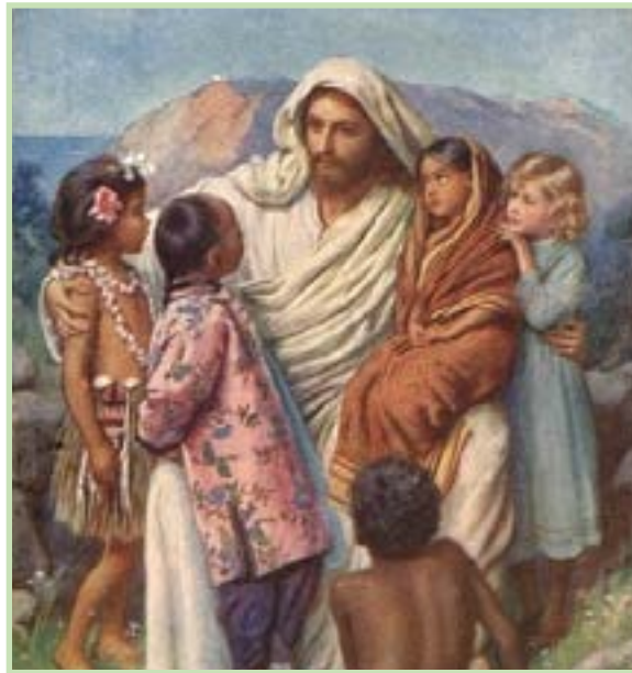
"Hope of the World," Harold Copping, 1915