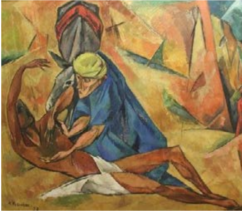
Heinrich Nauen, "The Good Samaritan"