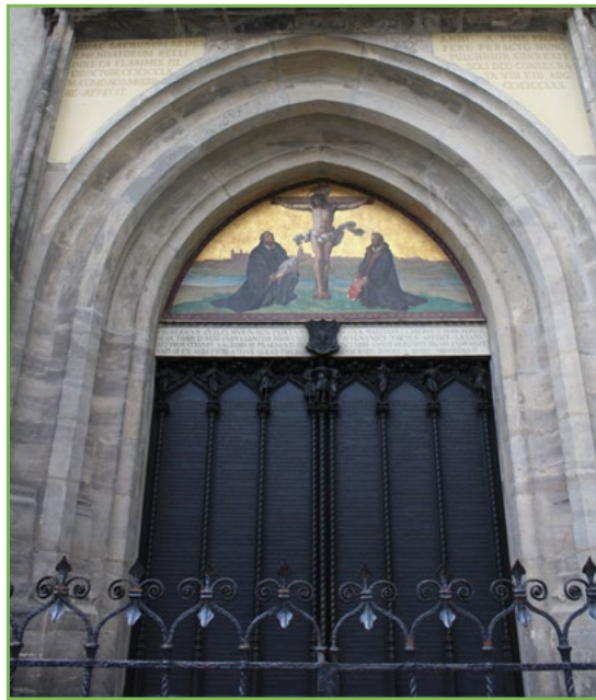
Castle Church Doors in Wittenberg, Germany