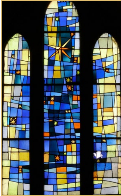
Heavenly Window at Chapelle Notre Dame de Grâce