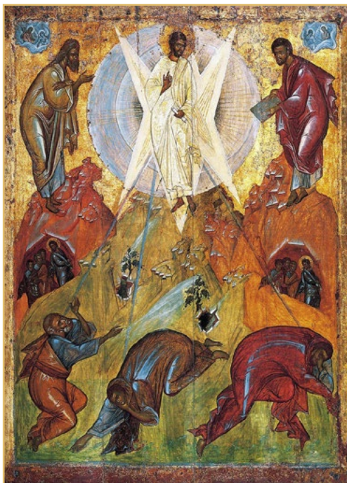
“Transfiguration,” 15th century, by Theophanes the Greek