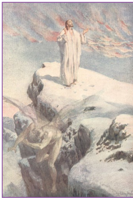
“The Temptation of Christ on the Mountain” William Hole, c. 1905