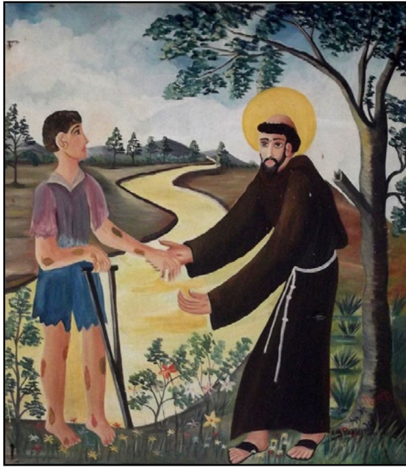
Priest reaching out to help a man with leprosy; Unknown, Canindé, Brazil