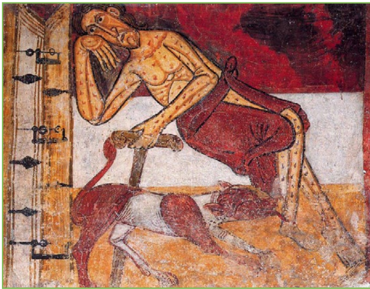
Lazarus waiting at the door, from Art in the Christian Tradition, a project of the Vanderbilt Divinity Library, Nashville, TN