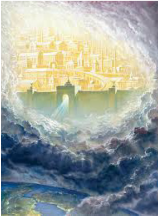
"A New Heaven And a New Earth"