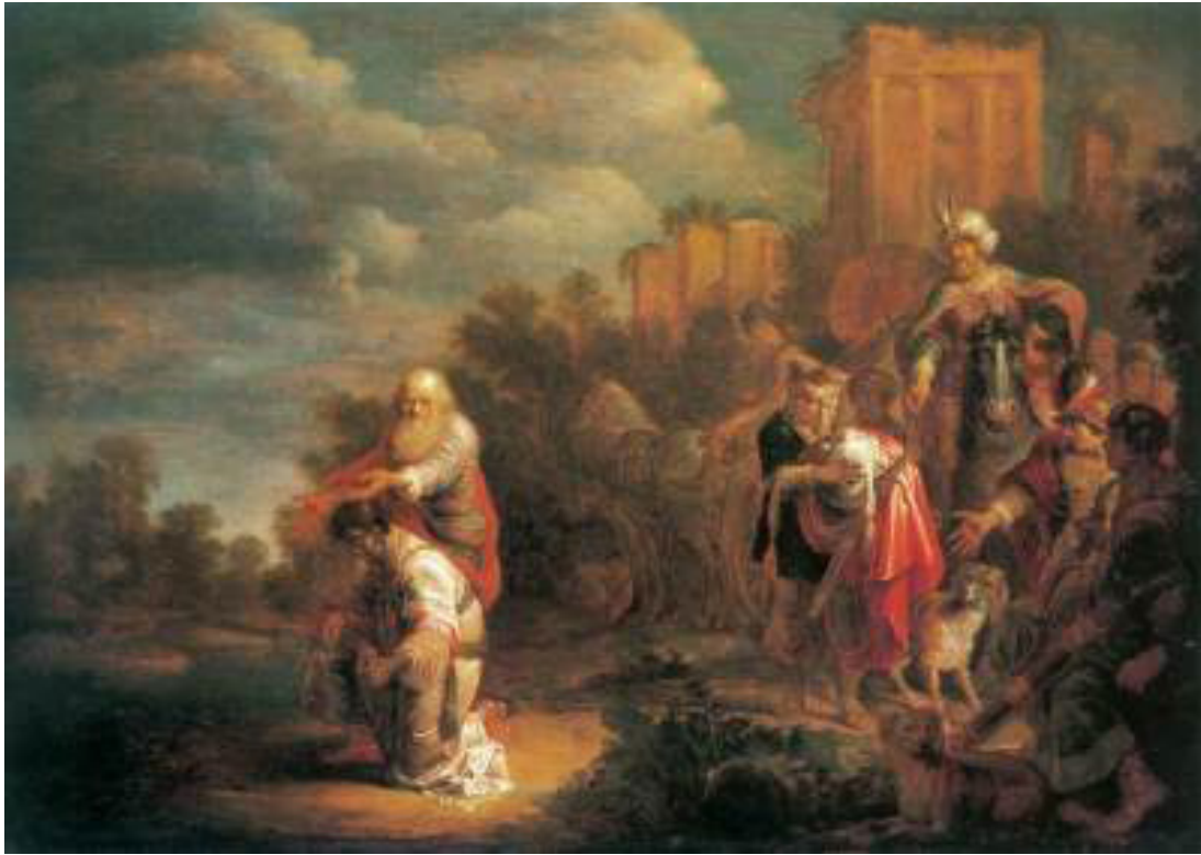
"The Baptism of the Ennuch"