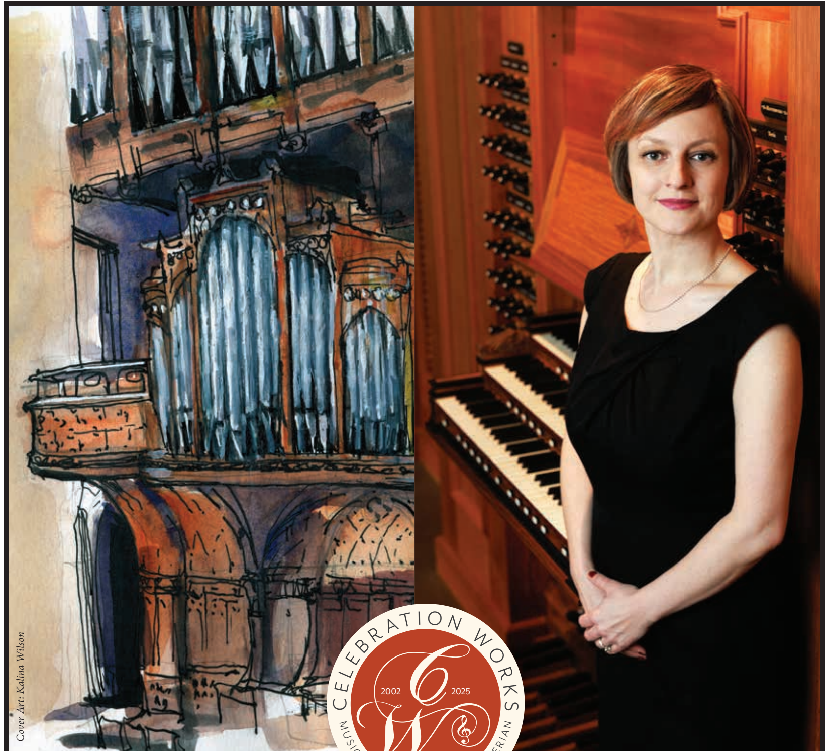
Cover Art: Kalina Wilson

and click DONATE , then choose "Prepaid CW Contribution" OR send a CHECK to the church with "Celebration Works" in the memo line OR scan this QR code to DONATE BY PHONE .